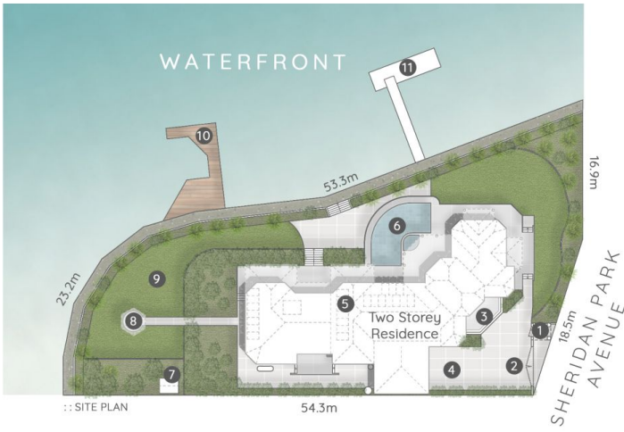
:: SITE PLAN