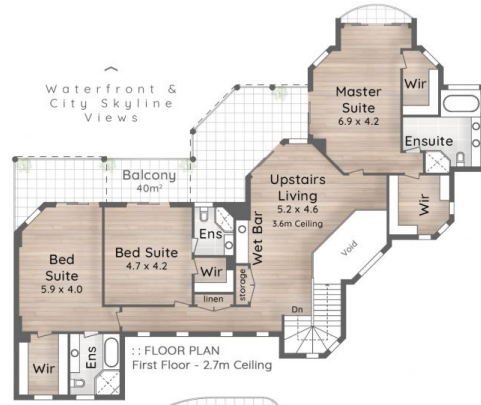
:: FLOOR PLAN First Floor - 2.7m Ceiling