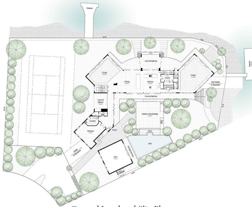
Ground Level and Site Plan

Dimensions are approximate. All information contained herein is gathered from sources we believe to be reliable. However we cannot guarantee its accuracy and interested persons should rely on their own enquiries.