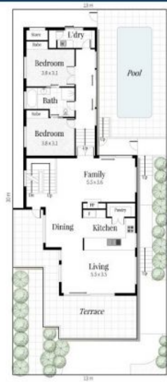
Brakes Crescent First Floor and Site Plan