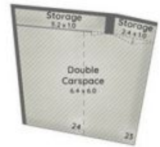
:: FLOOR PLAN Level 2