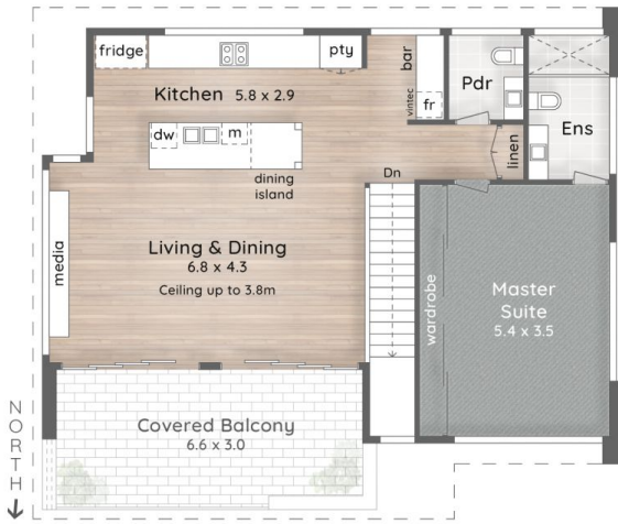
:: FLOOR PLAN First Floor - 2.7m Ceiling