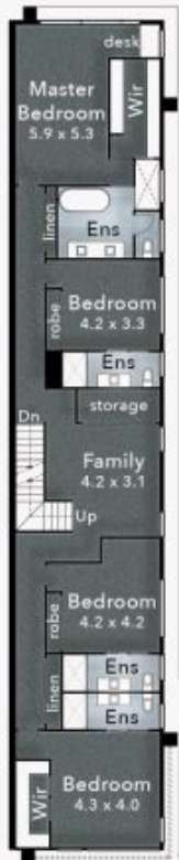
// FLOOR PLAN First Floor