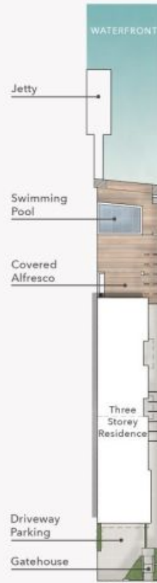
// SITE PLAN PARADISE ISLAND