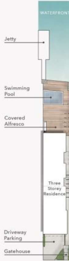
// SITE PLAN PARADISE ISLAND