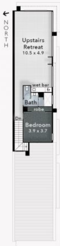
// FLOOR PLAN Second Floor