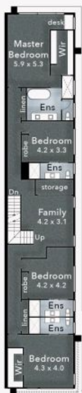
// FLOOR PLAN First Floor