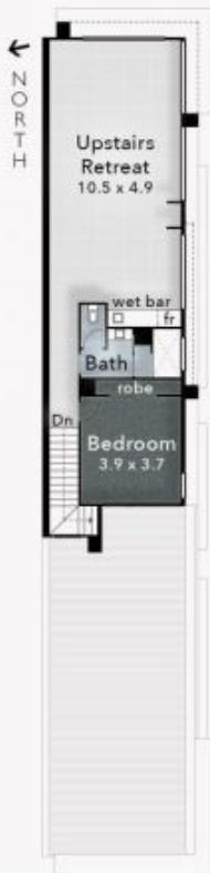
// FLOOR PLAN Second Floor