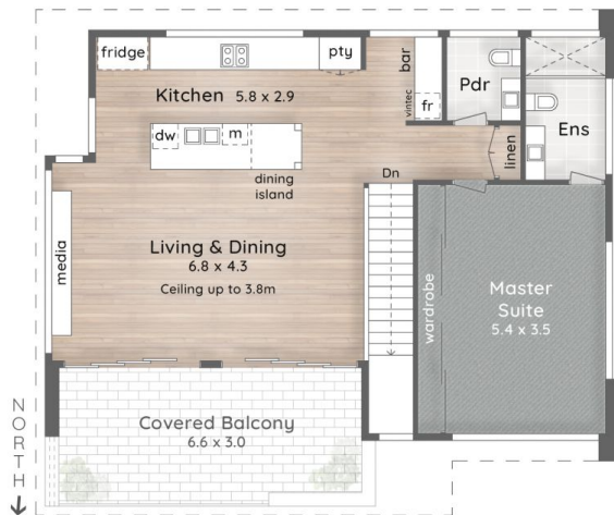
:: FLOOR PLAN First Floor - 2.7m Ceiling