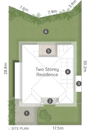
:: SITE PLAN KEELSON CRESCENT