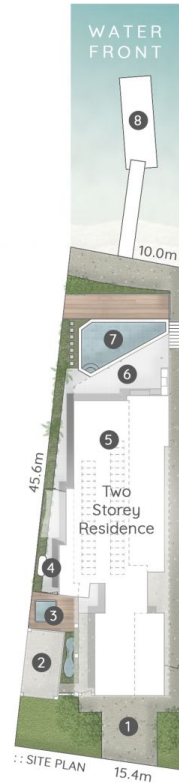
:: SITE PLAN 15.4m 45.6m 45.7m RIPPLE COURT