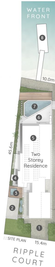
:: SITE PLAN RIPPLE COURT