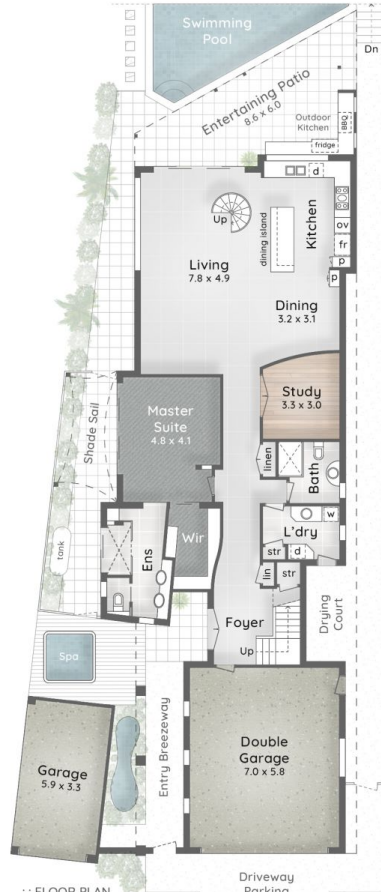
:: FLOOR PLAN Ground Floor - 2.7m Ceiling