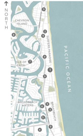
:: LOCATION MAP

JEWEL NORTH 13003/36 Old Burleigh Road SURFERS PARADISE