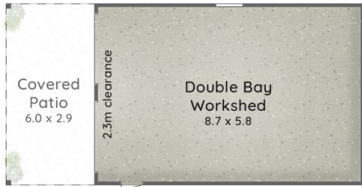
:: FLOOR PLAN (Not Actual Location)