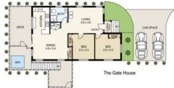
The Gate House