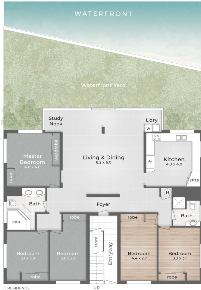
:: RESIDENCE Ground Floor