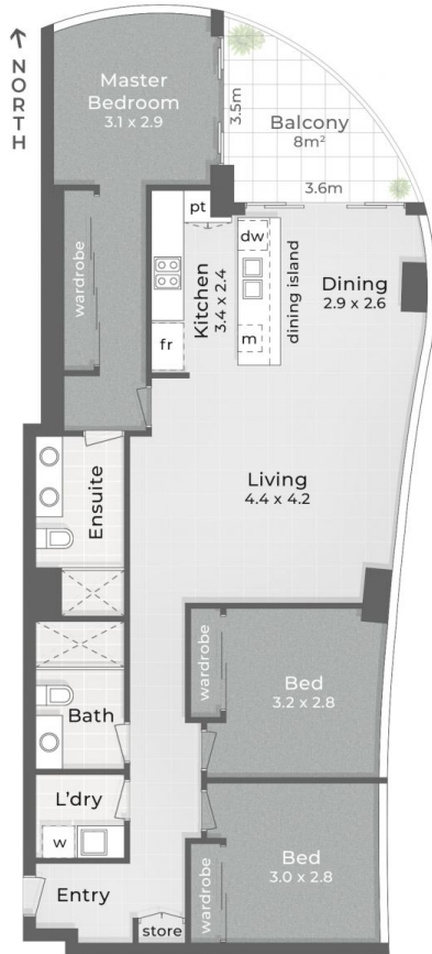
:: FLOOR PLAN Level 16 - 3.0m Ceilings