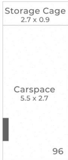
:: FLOOR PLAN Basement 1