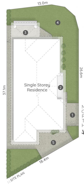
:: SITE PLAN