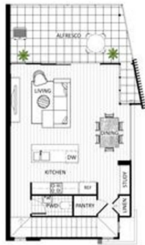
.. FIRST FLOOR