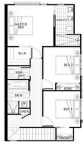
.. SECOND FLOOR

Whilst Amir Prestige Property Agents have made every attempt to ensure the accuracy of all measurements of this floor plan, Amir Prestige take no responsibility for any errors, omissions, or mis-statement. This plan is for illustrative purposes only.