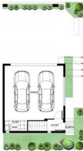
.. GROUND FLOOR

Ground Floor: 44.78m 2 | First Floor: 52.40m 2 | Second Floor: 67.24m 2 | Alfresco Area: 19.54m 2 | Total Area: 183.96m 2