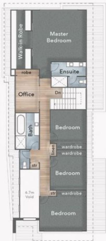
// FLOOR PLAN First Floor - 2.6m Ceiling