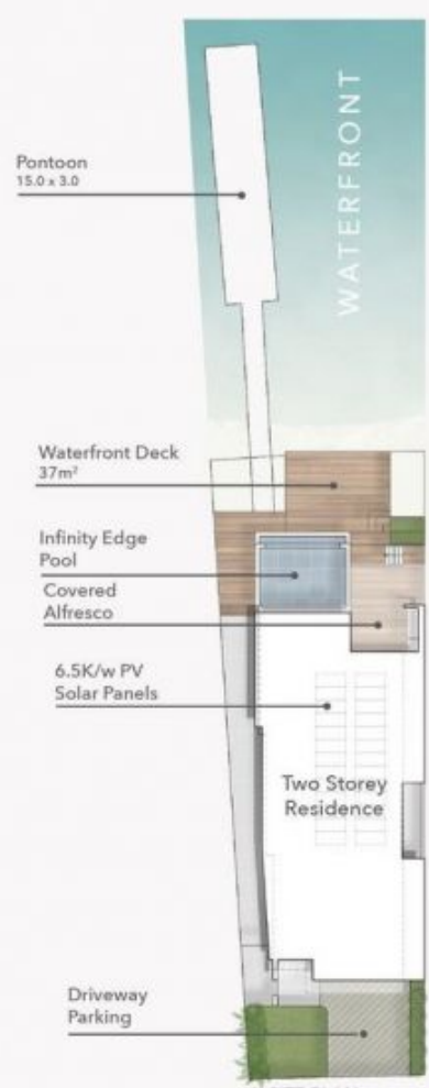
// SITE PLAN