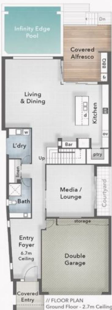
// FLOOR PLAN Ground Floor - 2.7m Ceiling