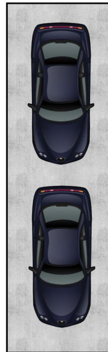
2 secure basement tandem car spaces

All information contained herein is intended as a guide only. Layout dimensions are approximate only. No representations or warranties of any nature are given and any interested parties should rely upon their own enquires