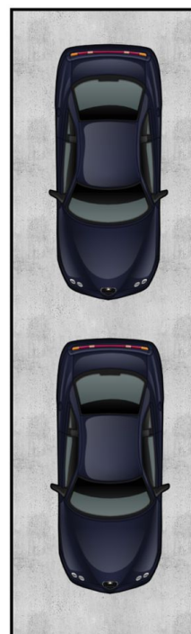
2 secure basement tandem car spaces

All information contained herein is intended as a guide only. Layout dimensions are approximate only. No representations or warranties of any nature are given and any interested parties should rely upon their own enquires