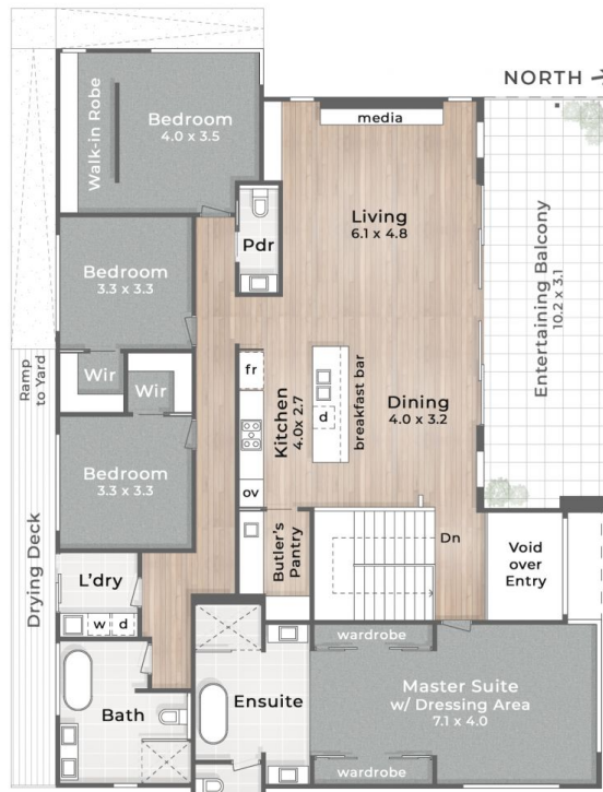
:: FIRST FLOOR 2.7m Ceiling