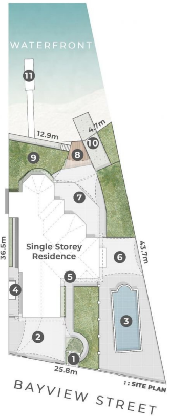
:: SITE PLAN