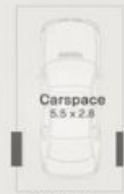
:: FLOOR PLAN Basement

DISCLAIMER: This is not a legal document therefore all measurements and information provided is subject to survey. No permission is given to use or alter this Floor Plan without the consent of Pure Design Concepts. The overall presentation style, layout, imagery, fonts, background, colours and terminology has been originally created by PDC and is subject to strict copyright. No ownership is taken of building design. Find out more at: www.puredesignconcepts.com.au