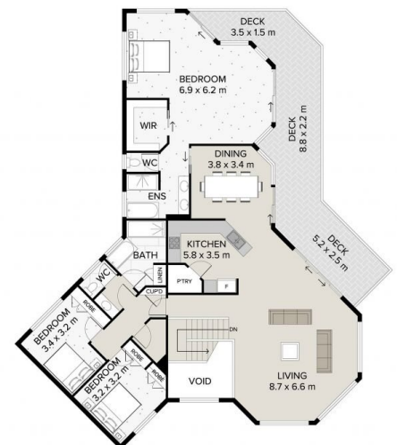
MAIN RESIDENCE FIRST FLOOR

Scale in metres. Indicative only. All information contained herein is obtained from sources we believe to be accurate. We cannot guarantee its accuracy. Interested persons should make and rely on their own enquiries.