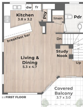
:: FIRST FLOOR