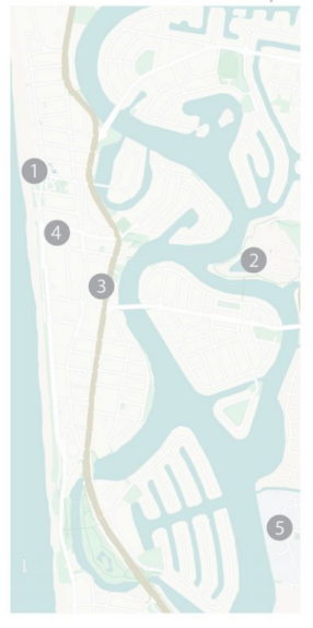
Location Map ::